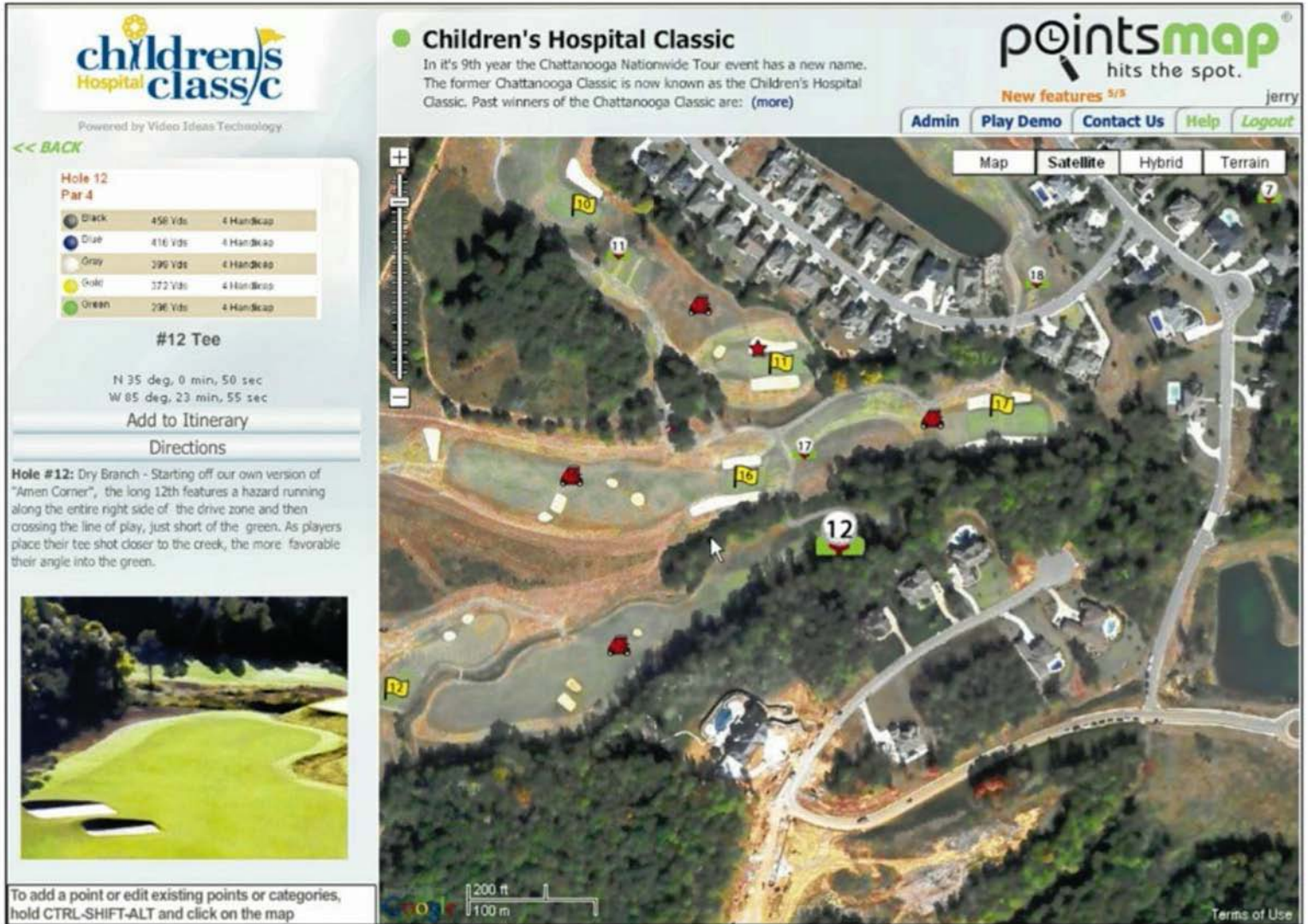
A computer screenshot taken online illustrates various points and information about the course at Black Creek Club.